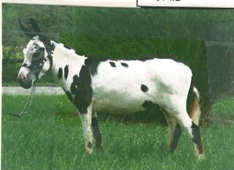
Troytown's Code of Silence 02.jpg

The American Donkey and Mule Society, PO Box 1210, Lewisville TX 75067 www.lovelongears.com/ (972) 219-0781 The American Donkey and Mule Society is not responsible for errors in information submitted to the registry.