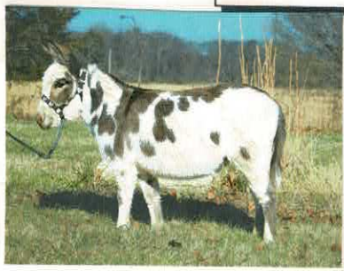
Sunny G's Lacie 4.jpg

The American Donkey and Mule Society, PO Box 1210, Lewisville TX 75067 www.lovelongears.com/ (972) 219-0781 The American Donkey and Mule Society is not responsible for errors in information submitted to the registry.