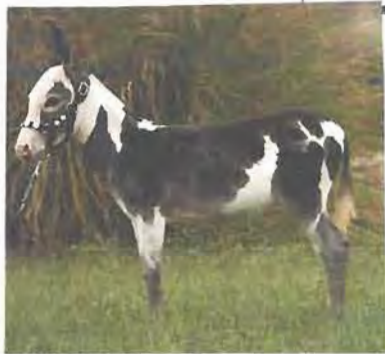
HHAA Hocus Pocus 2.jpg

The American Donkey & Mule Soc PO Box 1210 Lewisville TX 75067 (972) 219-0781 www.lovelongears.com