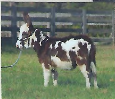
HHAA Goosebumps 2.jpg

The American Donkey and Mule Society P.O. Box 1210, Lewisville, TX 75067 (972) 219-0781 The American Donkey and Mule Society is not responsible for errors in information submitted to the registry.