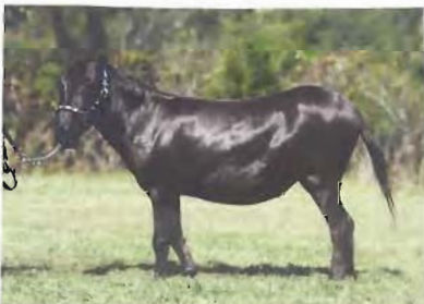
Dee's Cobra's Black Haired Raven